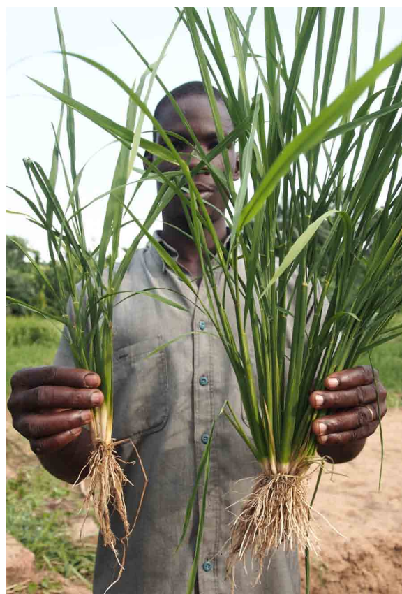
Fig. 1 - Comparison of one conventional plant (left) and one SRI plant (right), both planted at the same time with the same variety of rice by staff at the training site in Kakanitchoé, Benin.

Following patterns with consumption, rice has a large economic footprint throughout the region, again particularly in the western part. In Sierra Leone, for example, rice production accounts for 50% of the GDP, 10 while in Guinea, rice accounts for roughly two-thirds of all national cereal production. 11 As rice consumption continues to grow at a faster pace regionally than for other crops, West Africa as a whole has grown increasingly dependent on imported Asian rice, with potentially serious repercussions for national economies and governments. Senegalese rice imports make up 16% of the country's balance of trade, 12 and according to 2007 data, the country was producing only 20% of its rice demand, despite an excellent growing environment and a strong cultural identity with rice (their national dish is rice with fish). 13 The Gambia, as of 2000, was producing only 12% of its rice demand, even though rice is the single