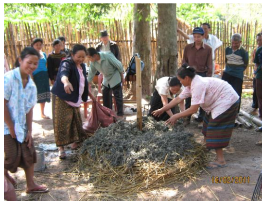
Filed Practice in the Houay Than Scheme