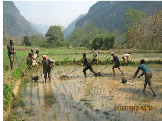
Photo 2: Communal SRI Activities for Weeding in the Nam Pa Scheme in Luang Prabang Province